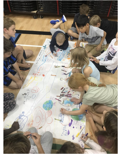
Students participating in Terry Fox Day activities.